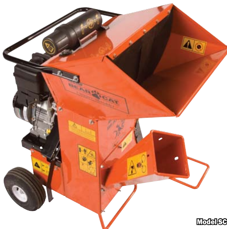
Model SC3305 (70080)

Belt Engagement Lever to allow for easy starting.