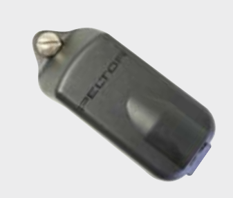
Spare battery pack ACKI5-EC