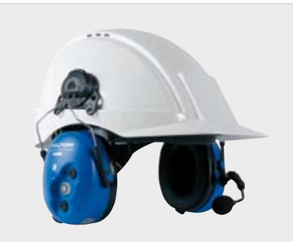
Ear protection headset MT53H7P3EWS2-EC Helmet mounting