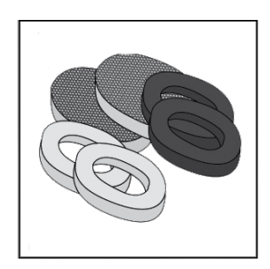
Hygiene set HY79