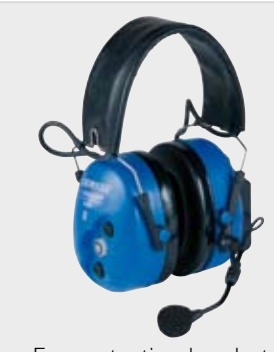
Ear protection headset MT53H7AWS2-EC Headband