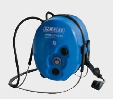
Ear protection headset MT53H7BWS2-EC Neckband