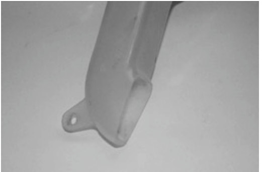
insert crank vent into the air boot.

3. Remove air box intake tube from the air box and use a hacksaw to cut approx. 1½" off of the air box intake tube. Your tube should resemble the one shown in Figure 1 . Re-assemble the air intake tube into air box and install back onto bike. Don't forget to tighten clamp around intake tube and re-