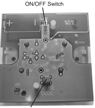
House Code Button

b) Also, within the same 15 minutes, place the Ei411 Remote Control into house code mode by pressing and holding the house code button until the amber light turns on. Release the button and the amber light will now flash continuously (for 15 minutes) to show it is in house