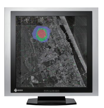
2K × 2K Primary Monitor

The Raptor 4000-R and 4000e-R are the industry's only boards to offer portrait mode display for monitors of up to 30" without sacrificing advanced