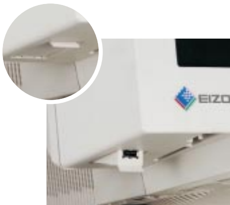
Drop down access lid

The F67 comes equipped with one upstream port for the computer and four downstream ports. Three of the downstream ports are located on the rear of the F67, and another port with a drop down lid for convenient access is positioned on the front.