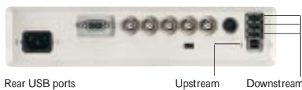
Rear USB ports