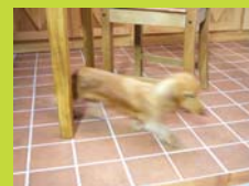
Conventional digital camera

Picture Stabilization Mode (Anti-blur mode) automatically corrects for camera shake and subject blur, helping you to capture fleeting moments in crisp stop-action with background detail intact.