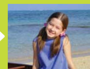
3x Optical zoom