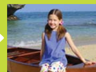
2x Optical zoom