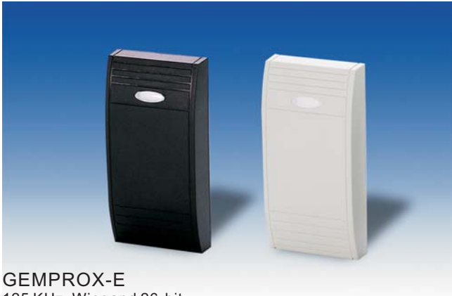
GEMPROX-E 125 KHz, Wiegand 26-bit hexadecimal format output Size:88(L) X 44(W)X16(D)mm

The auxiliary reader must not be further than 50 meters from the DG-600E. Also this reader should be nearer than 60 centimeters, to avoid disturbance. The suggested wire gauge is #22~26 AWG. Split of units for DG-600E and auxiliary reader in ranging up to 50 M bring out the friendly system device for low cost but high security with anti-tampering as well as convenience and reliability.