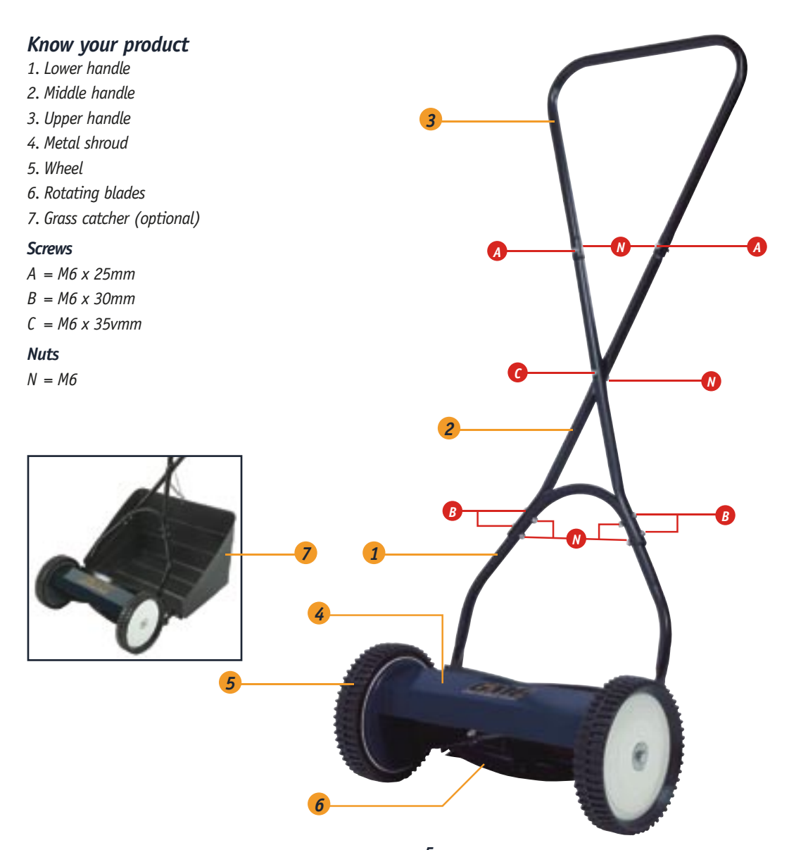
Download from Www.Somanuals.com. All Manuals Search And Download.