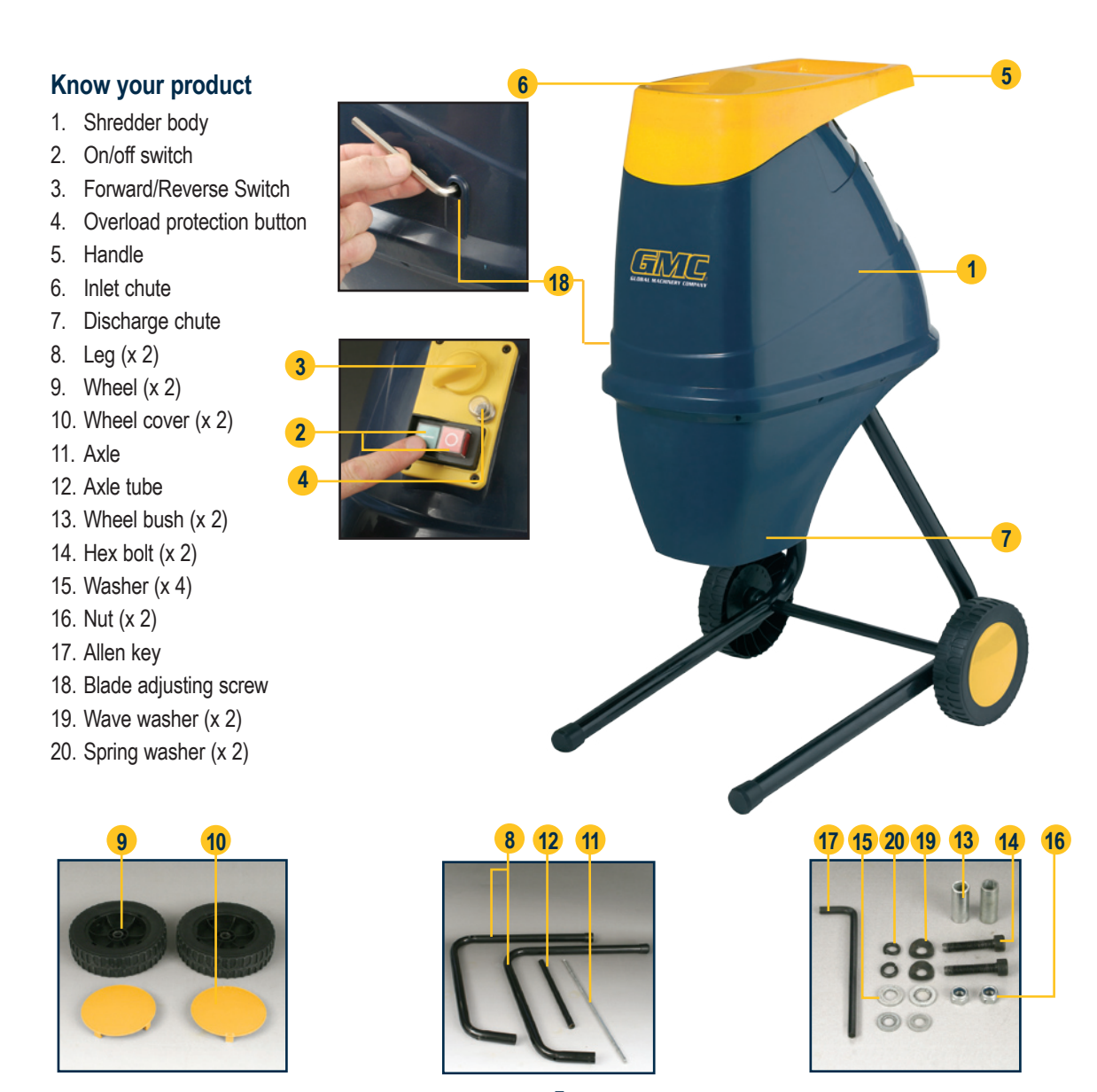
Download from Www.Somanuals.com. All Manuals Search And Download.