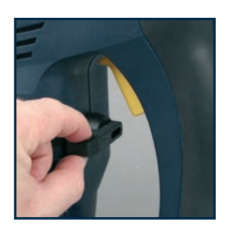
The hammer function switch (7) can be turned to the left \mathbf{1} or to the right \mathbf{1} as required.