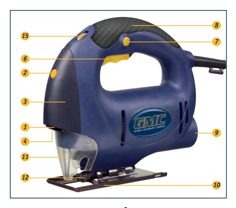
Download from Www.Somanuals.com. All Manuals Search And Download.