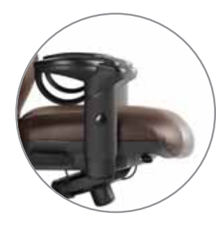
Adjustable seat depth push button on edge of seat and slide seat to match leg length.