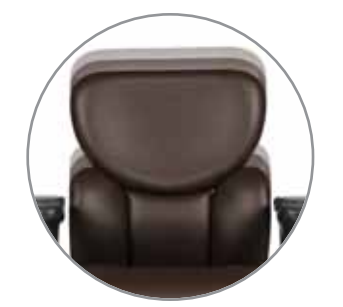
Back & Lumbar area are height adjustable on ratchet system. Position lumbar area for user comfort.