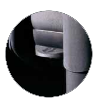
The edge of each Nucas Chair seat has a small drawer that contains an instruction booklet detailing how to set and adjust your chair so you get the full benefit of all of it's state of the art features.

Today, office productivity is a big concern, and proper ergonomic seating is seen as a solution to sick time generated by poor posture and RSI's (Repetitive Strain Injuries). In fact, next to the common cold, back pain and RSI's are the most common causes of lost days at work. NuCAS addresses these issues by making chair adjustment immediate, accessible, and easy. Global's NuCAS captures major attention with its state of the art chair. Slide the seat out and move the arm out and up to provide additional space for a wide, six foot tall individual, or reduce seat depth and arm settings for smaller users. Locate the Dynamic Lumbar Support (flexes to fit your back and adjusts with your movements) at the right height for you. It's a dream chair, one that is comfortable, easy to adjust, fits everyone, increases productivity and reduces down time.