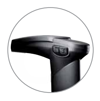
Standard T Style Arm (SM) Black Nylon, with push buttons and soft urethane arm pad.