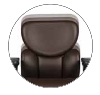
Back & Lumbar area are height adjustable on ratchet system. Position lumbar area for user comfort.