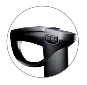
Optional Loop Arm (NL) Black Nylon, with push buttons and soft urethane arm pad.