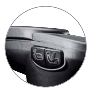
Most Adjustments are made while seated by activating button controls built into the armrests.