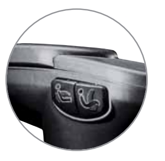
Most Adjustments are made while seated by activating button controls built into the armrests.