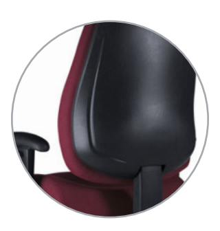
Back Shroud - A protective outside back shroud offers increased durability.

*Standard on 2432-16, 2433-16, 2452-16 and 2453-16 Dexter Plus models only ** Standard on 2452-16, 2453-16, 2456-1, 2457-1 models only