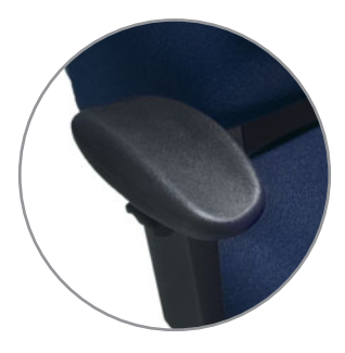
Concave Oval 3M Arm - Is standard on Dexter and Dexter Plus, and is height and width adjustable to provide a custom fit for the user.

Tel (416) 661-3660 (800) 668-5870 Customer Service: Fax (800) 361-3182