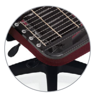
Seat Structure - heavy duty 14" steel tube seat frame with Perma-Mesh<sup>™</sup> seat suspension, provides superior comfort.