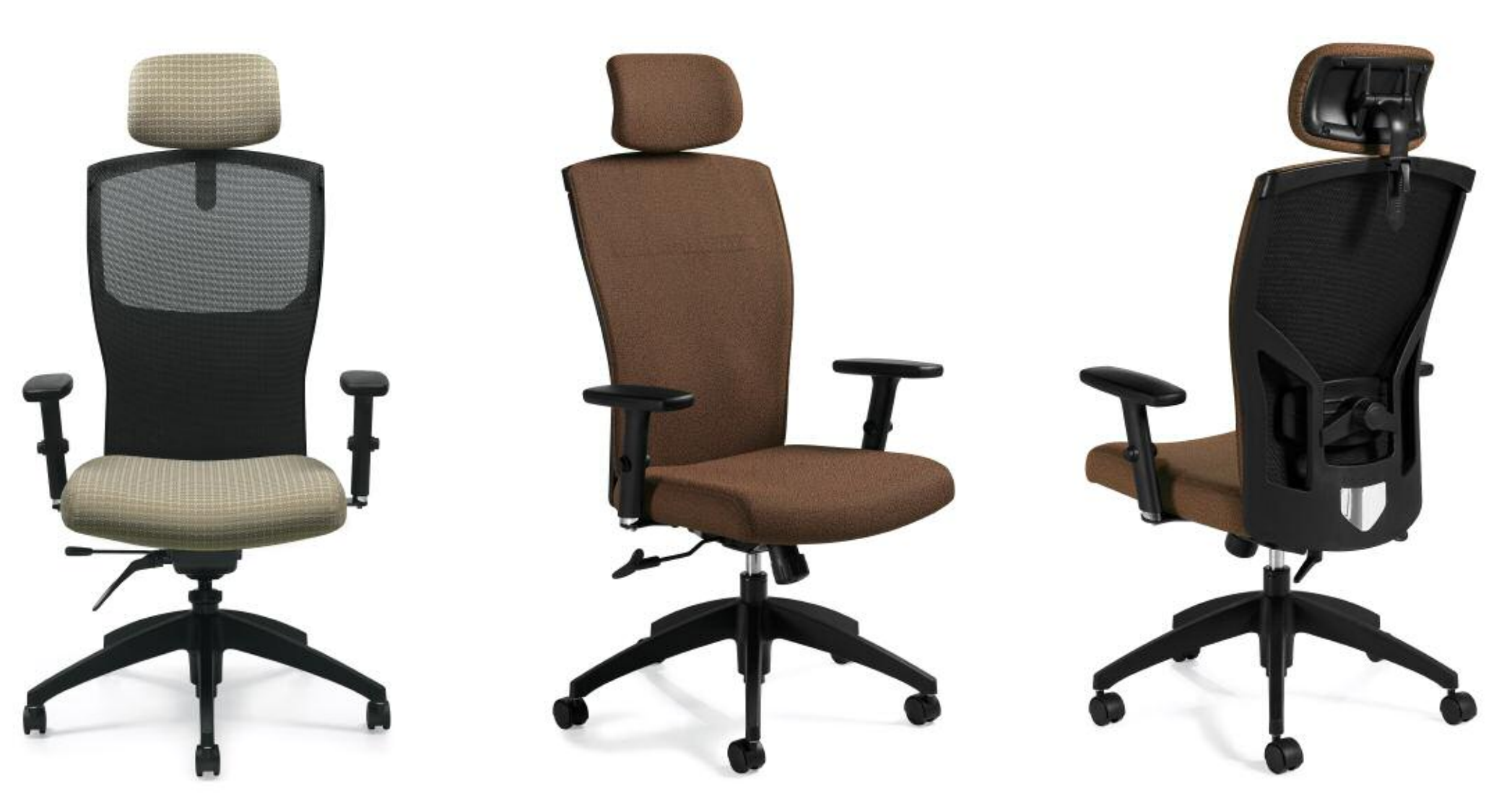
1960-2 High Back Knee-Tilter with adjustable Headrest, shown in GIG GIG1 Stone

Alero combines comfort and performance with exceptional value and design.