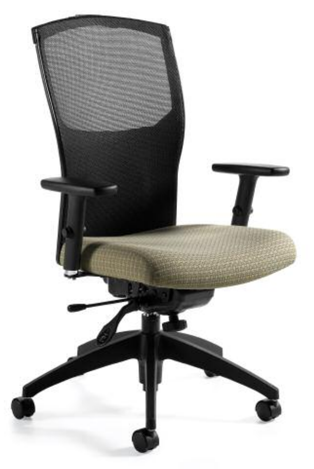
1961-2 High Back Knee-Tilter (no Headrest), shown in GIG GIG1 Stone. Also, shown on cover in Momentum OHS Warmth OH12

Corporate Member Of The Membre corporatif de l'