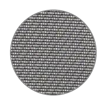
Back support is made from elasticized, breathable mesh material that provides comfortable support that contours to your body.