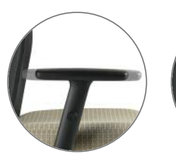
Arms are height adjustable and feature a "sliding armcap" that can be moved forward and rearward to provide better support for keyboarding.