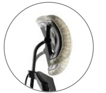
Headrest is height and angle adjustable to suit your personal preferences.

In today's modern office where computer related activities are crucial, it is extremely important that one's choice in seating encourages comfort and productivity. Alero's fully upholstered or breathable mesh back and comfortable padded seat create the perfect blend of comfort and design. Many adjustable features and a choice of functional mechanisms ensure the chair will perform well. Choose a sophisticated Multi-tilter for computer intensive activities or a tilter chair for casual offices or meeting rooms. All chairs feature an adjustable lumbar support that allows the user to customize the comfort of the back.