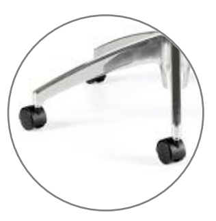
Standard Base is fiberglass reinforced black Nylon. Polished aluminum base is optional. Casters are available for both carpet or hard surfaces.