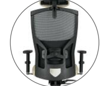
Chair frame Fibre glass reinforced nylon frame is very durable.