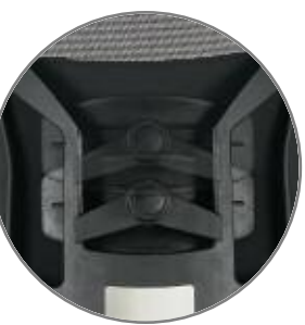
Lumbar support can be moved up and down. Depth can be adjusted by turning the knob.