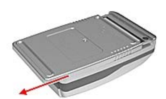
Remove battery cover