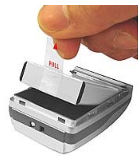
Removal of Li-ion battery