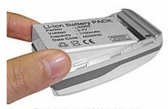
Replacement of Li-ion battery