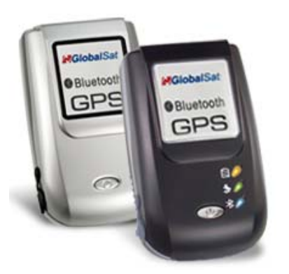
BT-338 (SiRF III)