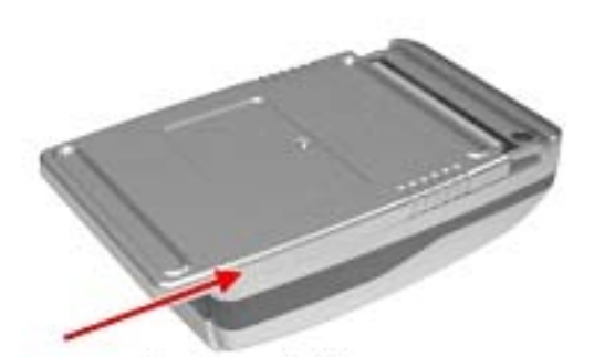
Replace battery cover