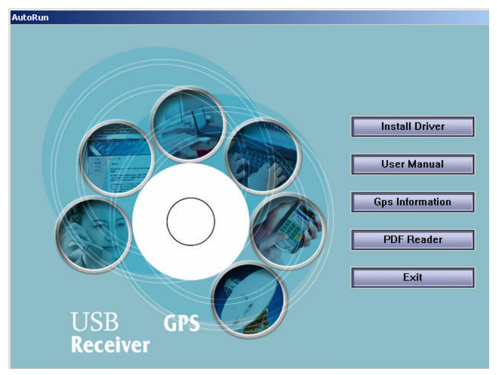
PAGE 4 OF 13