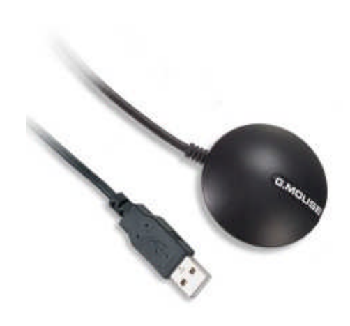
BU-353 (SiRF III)

(Information on installation of the USB driver contained in this document is also applicable to our USB cable set #BR305-USB )