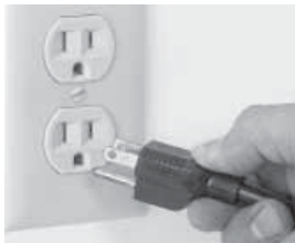
Fig. 6-1 Correct

THIS MACHINE IS PROVIDED WITH A THREE-PRONG GROUNDING PLUG. THE OUTLET TO WHICH THIS PLUG IS CONNECTED MUST BE PROPERLY GROUNDED. IF THE RECEPTACLE IS NOT THE PROPER GROUNDING TYPE, CONTACT AN ELECTRICIAN. DO NOT UNDER ANY CIRCUMSTANCES CUT OR REMOVE THE THIRD GROUND PRONG FROM THE POWER CORD OR USE ANY ADAPTER PLUG (Fig. 6-1 and Fig. 6-2).