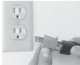
Fig. 6-2 Incorrect