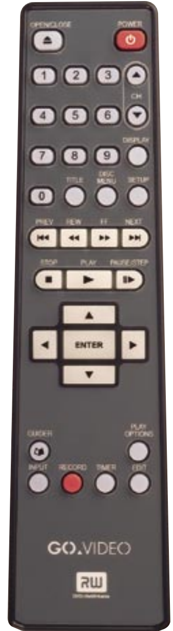
Full Function Remote