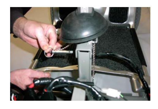
Step 6: Remove the safety retaining clip from the ball detent pin and pull the pin out.