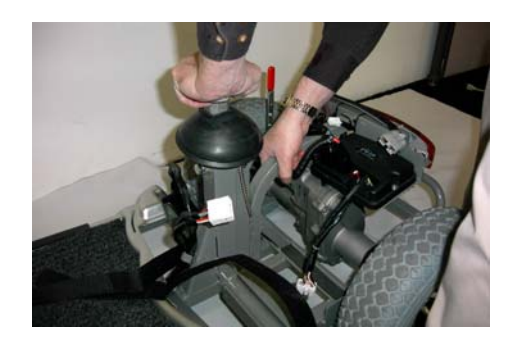
Step 7: With one hand, grab the top of the seat post, with your other hand grab the curved rear support member. Lift and separate front half from rear.