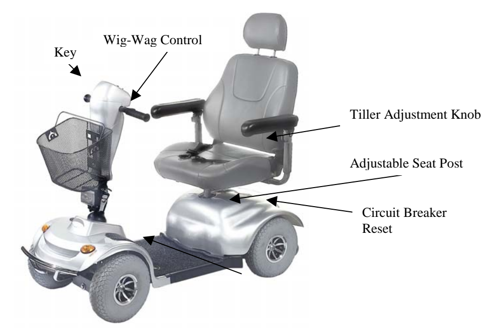
FOR YOUR RECORDS:

Please fill in your Avenger™ information below. This information will be useful in the event that you ever need to contact Golden Technologies concerning your scooter.