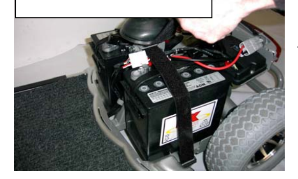
Step 5, Number 1: Unplug the two gray battery connectors.