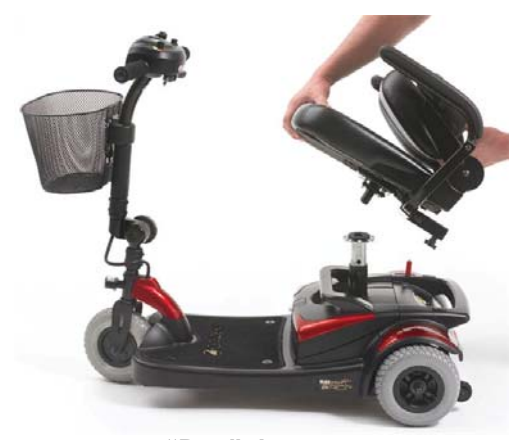
"Pop" the seat.

<u>Step 3</u> - While holding the seat rotation lever up, grip the seat and remove from the scooter – Your seat will pull out of the post. Grip the seat on opposite sides and, with a firm grip, pull the seat straight up towards you to remove.