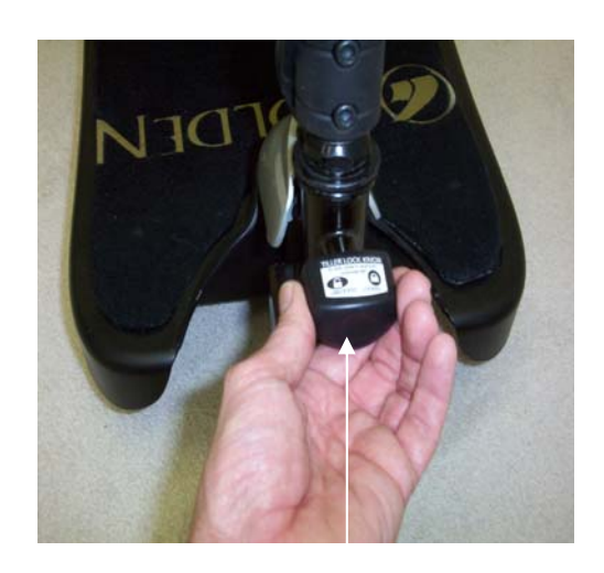
Turn this knob to lock the front wheel