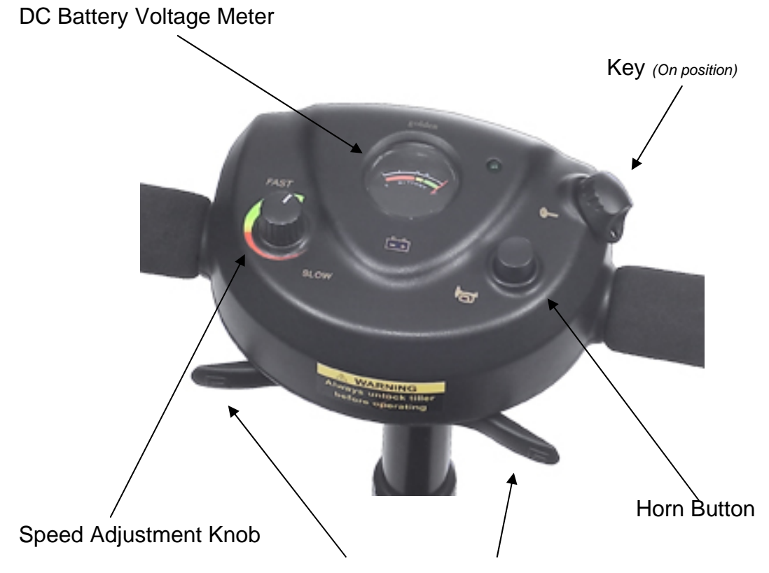
(Reverse) Drive Control Lever (Forward)