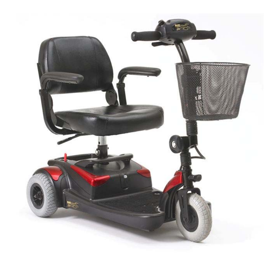
GB-106 and GB-106XR Buzzaround Lite™