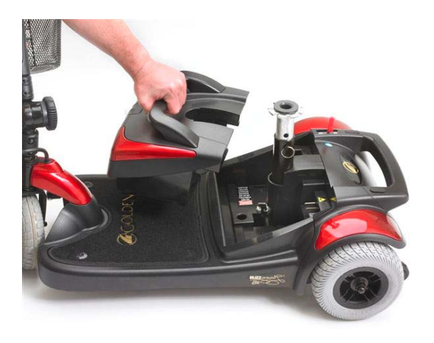
<u>Step 4</u> - Lift the battery box from the scooter. This will unlock the frame latch automatically.