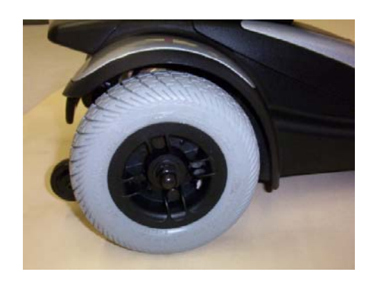
Rear Tire Solid/Foam-filled