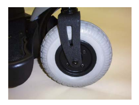
Front Tire Solid/Foam-filled

Your Buzzaround Lite™ scooter is equipped with "split-rim" wheels and foamfilled tires.