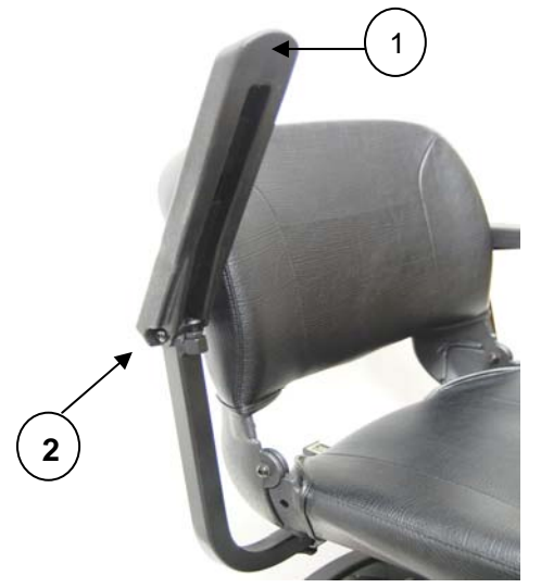
Figure 7. Flip-up/Angle Adjustment