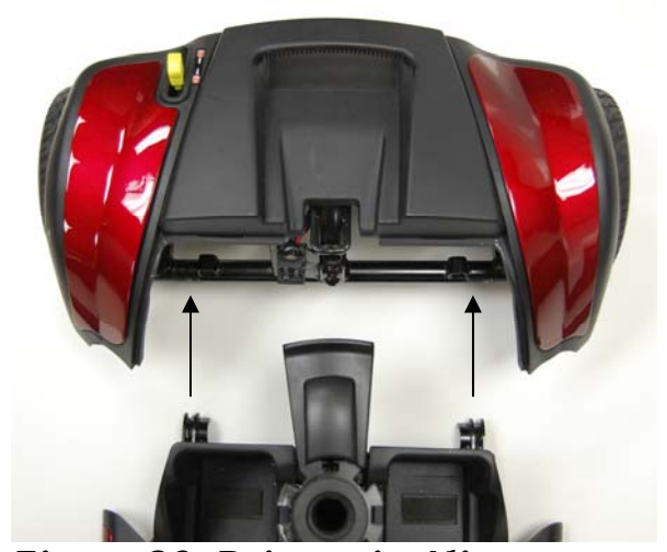
Figure 20. Drivetrain Alignment

3. Gently lower the battery pack onto the frame. See figure 22.