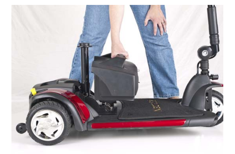
Figure 22. Battery Pack Installation