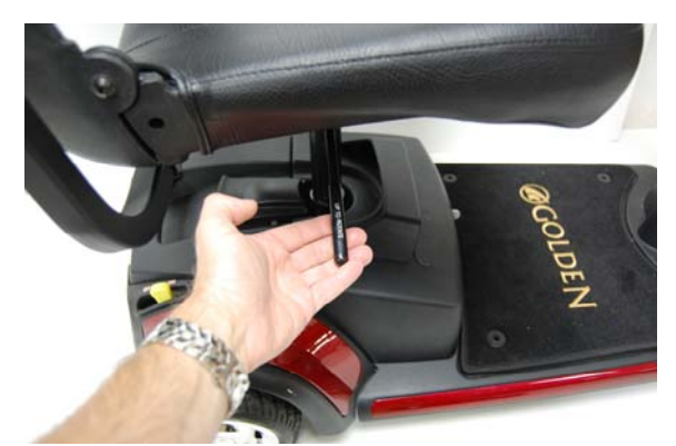
Figure 8: Seat Rotation Adjustment