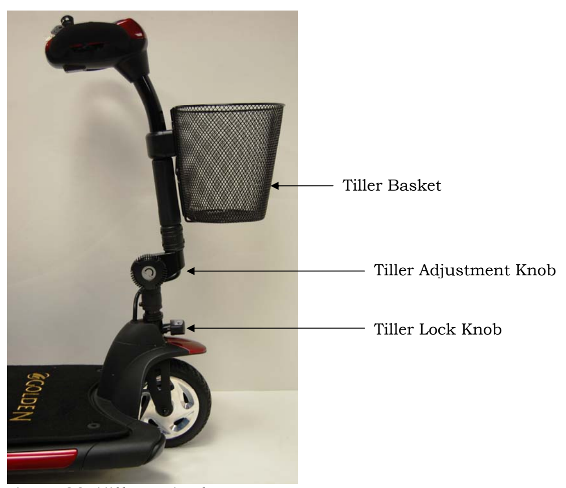
Figure 23. Tiller Raised

WARNING MAKE SURE YOU TIGHTEN YOUR TILLER KNOB TO BE SURE IT IS SECURED IN THE DESIRED POSITION!