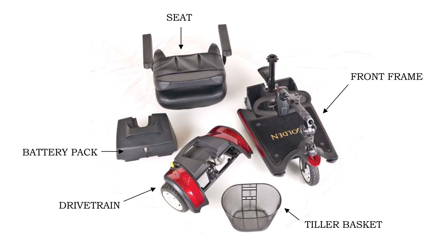
Figure 19. Buzzaround XL Components

Ensure that all components in the scooter have been correctly assembled. During assembly, please check that all connecting/locking devices are holding in place.