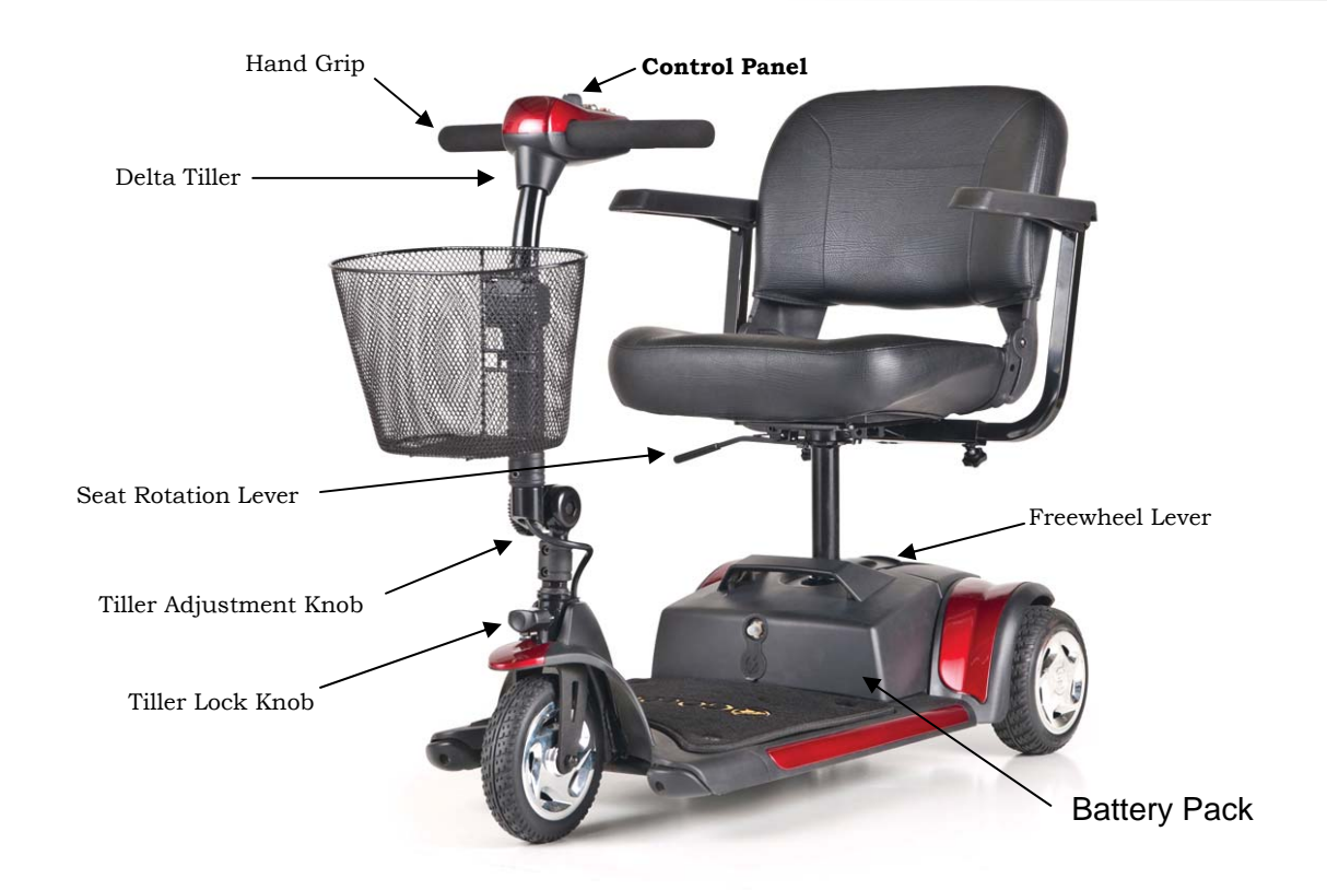
Figure 4. Your Golden Buzzaround XL