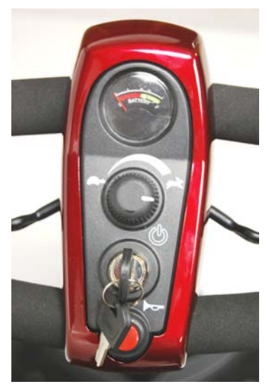
Figure 13. Key Switch (Off)