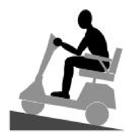
Figure 2. Going Up an Incline