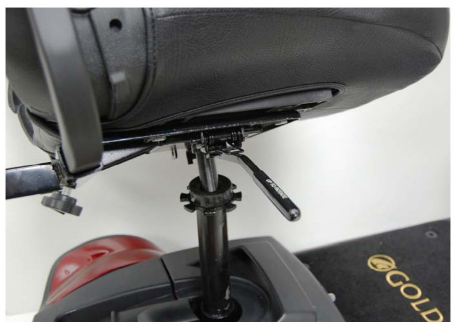
Figure 24. Installing the Seat

WARNING Pinch Point! Keep hands and clothing clear of the seat swivel post and seat post.