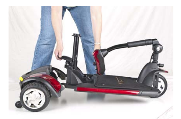
Figure 18. Separating the Drivetrain and Frame