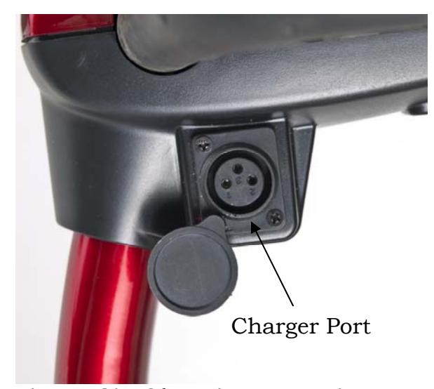
Figure 27. Charging Batteries