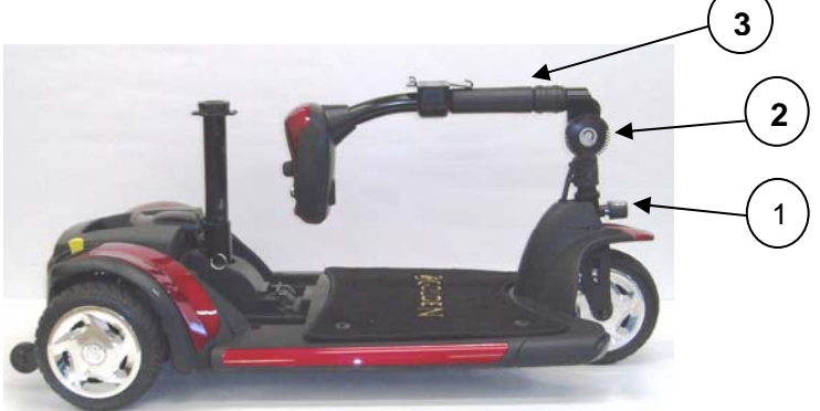
Figure 17. Lowered Tiller

6. Push in and turn the tiller lock clockwise 90 degrees. See #1 on figure 17. This will lock the front wheel to keep it from turning side to side to help control while carrying.