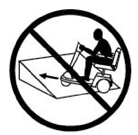
Figure 3. Traversing an Incline

WARNING If, while you are driving down a slope, your scooter starts to move faster than you feel is safe, release the throttle control lever and allow your Buzzaround XL to come to a stop. When you feel that you again have control of your scooter, push the throttle control lever forward and continue safely down the remainder of the slope.