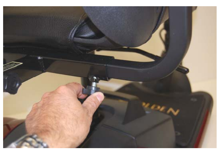
Figure 6. Armrest Width Adjustment