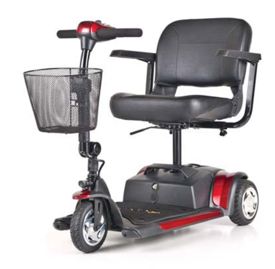
Figure 25. Buzzaround XL

NOTE: All Golden Buzzaround XL scooters can be equipped with docking devices for loading onto a vehicle by means of a mechanical lift or hoist. Contact your Golden Technologies, Inc. dealer for more information concerning docking devices and scooter lift devices.