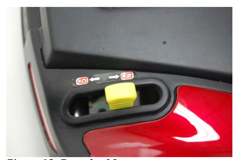
Figure 12: Freewheel Lever

Your Buzzaround XL<sup>TM</sup> is equipped with a freewheel lever that can set your scooter in or out of freewheel mode.