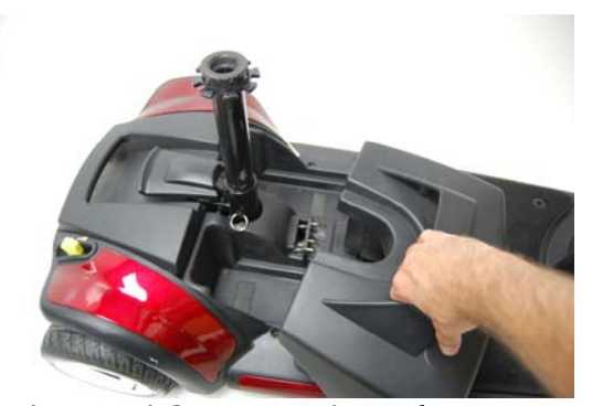
Figure 16. Removing the Battery Pack

4. Lift the battery pack off the scooter. See figure 16.