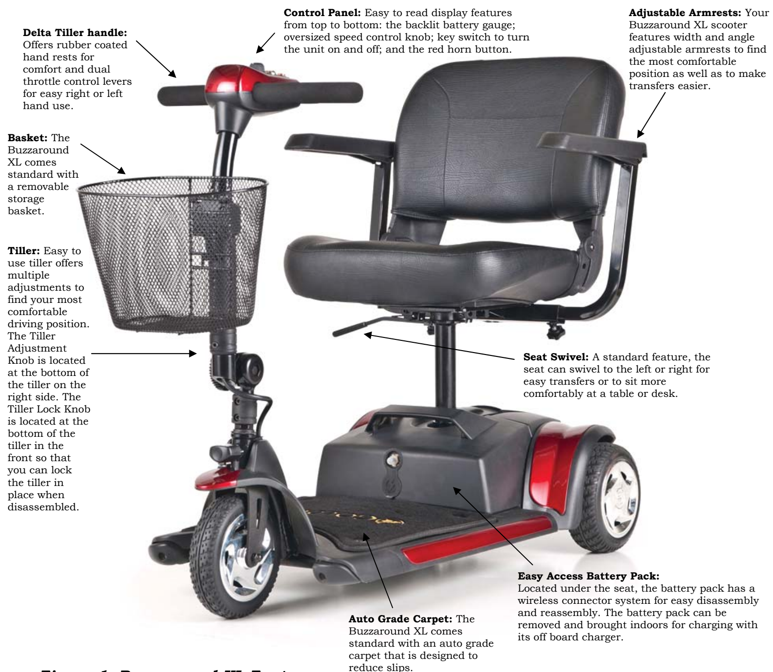
Figure 1. Buzzaround XL Features

Your Buzzaround XL™ scooter has been designed with your comfort in mind. It has also been designed to be a safe method of transportation when safety and operating instructions are followed. Please review the features and benefits of certain components of the Buzzaround XL scooter below.