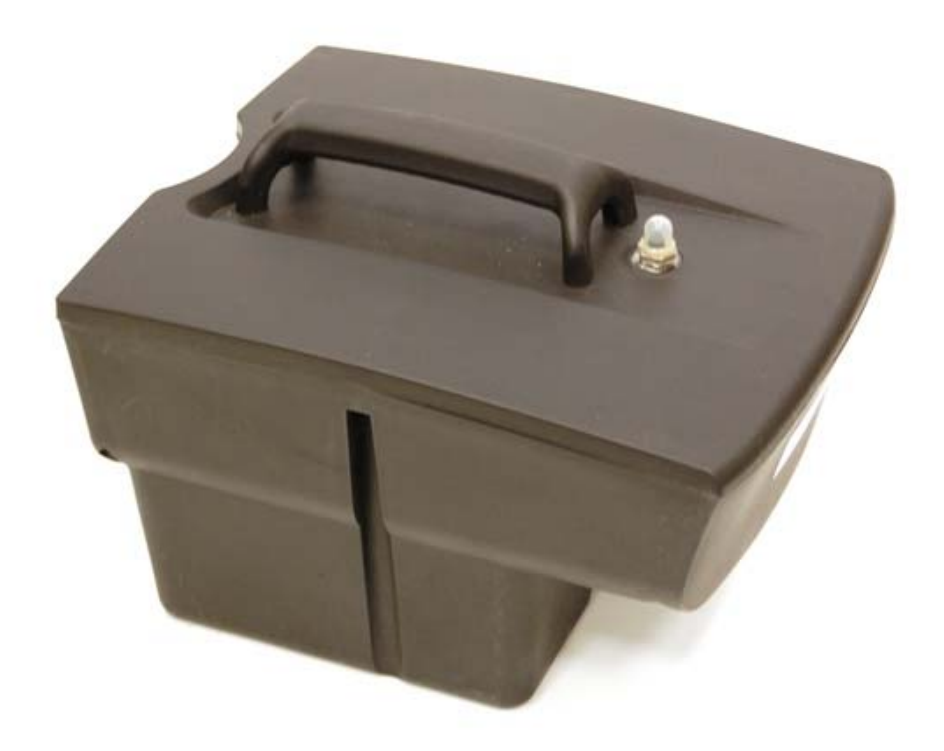
Battery Pack Figure 12

Should your battery need replacement; please contact your Golden Technologies representative. Battery replacement requires disassembly of the battery pack and must be performed by a qualified technician.