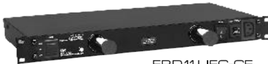
EPD 11 L IEC-CE EPD 11 LV IEC-CE