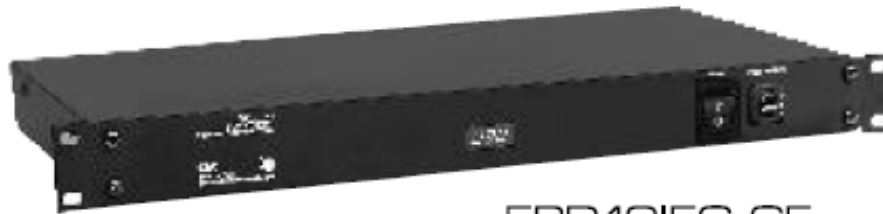
EPD 10 IEC-CE EPD 10 V IEC-CE