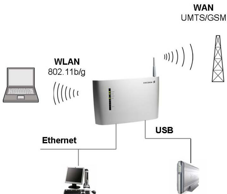
Figure 1 - Overview of Interfaces for the Ericsson W20/W21

The Ericsson W20/W21 provide data capabilities such as data access (e.g. Internet) in the respect that it allows multiple computers to be connected to the terminal using Ethernet or wireless LAN (WLAN).