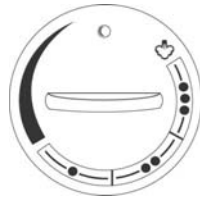
Temperature Control Dial