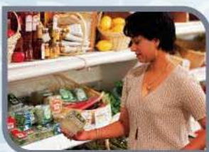
• Drugstore / Convenience store