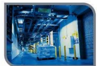
• Warehouse / Office building