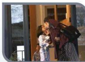
• Day care center / Home security