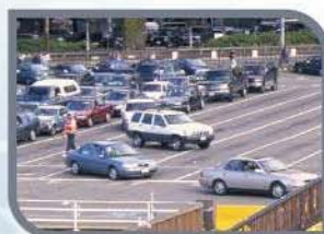
• Parking lots / Gas station