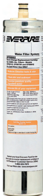
EFS8002 Replacement Cartridge: EV9781-10

Replacement filter for Cuno® Series 8000 systems