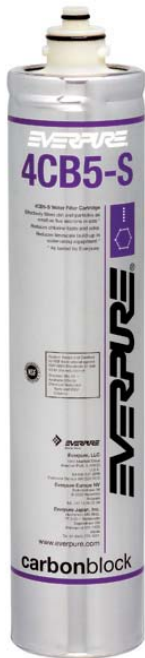
4CB5-S Replacement Cartridge: EV9617-21

Delivers quality water for foodservice, vending and OCS applications