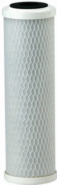
CG53-10 Replacement Cartridge: DEV9108-53