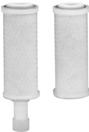
CWS-10 Carbon Block Filter Wrap: EV9799-06

Adds sediment and carbon filtration capabilities to Wrap ScaleStick®, which provides scale and corrosion control