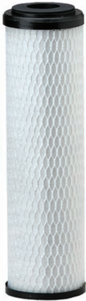
CG5-10S Replacement Cartridge: DEV9108-17