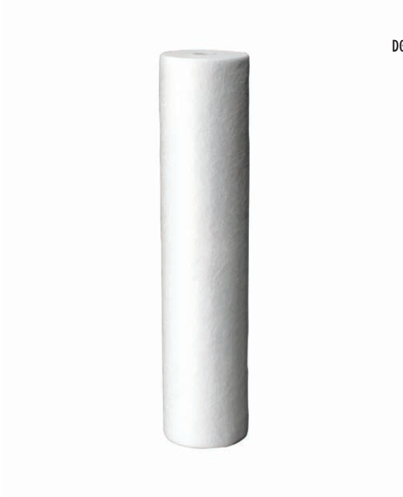
DGD-5005-20 Cartridge: DEV9108-37