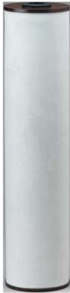
RFFE 20-BB5 Replacement Cartridge: DEV9108-46