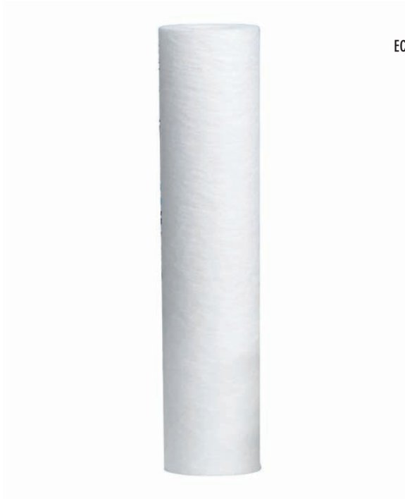
EC110 Prefilter Cartridge: EV9534-12