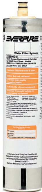
EFS8002-S Replacement Cartridge: EV9781-12

Replacement filter for Cuno® Series 8000 systems