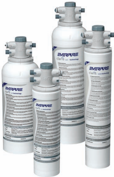
Claris Small Cartridge: EV4339-10 Claris Medium Cartridge: EV4339-11 Claris Large Cartridge: EV4339-12 Claris XLarge Cartridge: EV4339-13 Claris Head: TBA

Adjustable ion-selective filters to tailor carbonate hardness levels in potable water