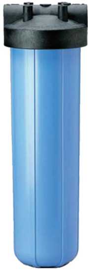
BB Housing 3/4: EV9104-50

Big Bowl Housing for 20" H X 4 1/2" diameter cartridges