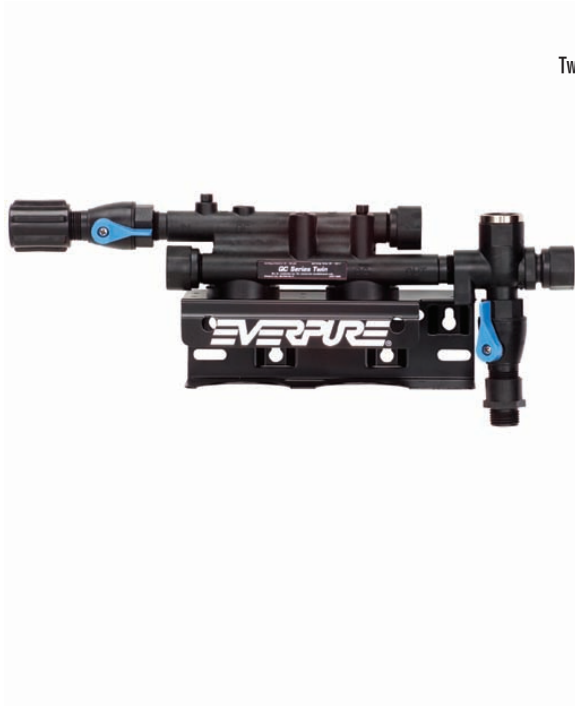
Twin Series Head: EV9272-24

Series filter head exclusively for Everpure replacement cartridges