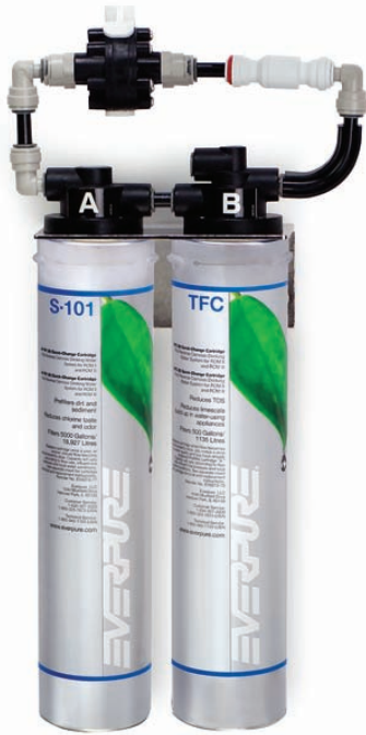
ROM II System: EV9273-75 S-101 Cartridge: EV9273-77 TFC Cartridge: EV9273-70

Delivers premium quality RO water for drinking water applications