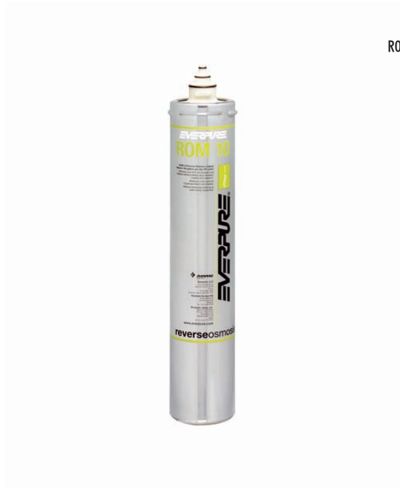
ROM 10 Replacement Cartridge: EV9273-91

Delivers premium quality water for office and vending applications