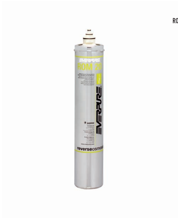
ROM 20 Replacement Cartridge: EV9273-93

Delivers premium quality water for office and vending applications