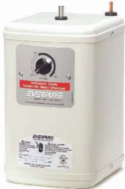
Solaria Water Appliance: EV9318-40

Low volume premium water appliance for drinking water applications