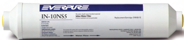
IN-10 NS5: EV9100-72