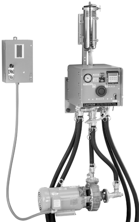
SSFM-100BC-SYS P/N 169090 Replaces P/N EV906404

Super Water Disinfection Hazardous Areas Offshore