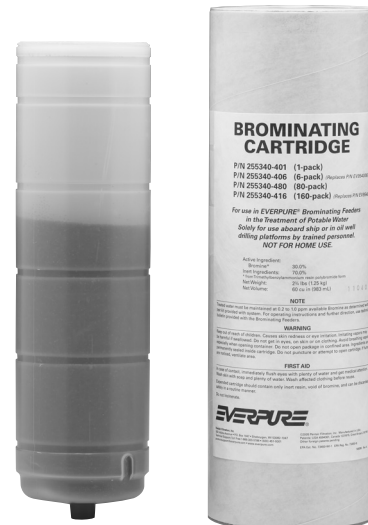
Everpure Bromine Cartridge P/N 255340-406 Replaces P/N EV954006