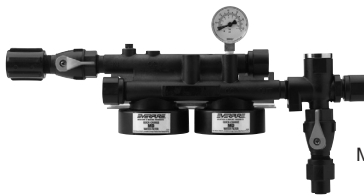
MD Dual Head Assembly* P/N 169111 (1 Pack) Replaces P/N EV927402 Designed for use with MD-HN & MD-HE filter cartridges.