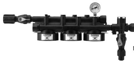
MD Triple Head Assembly* P/N 169112 (1 Pack) Replaces P/N EV927403 Designed for use with MD-HN & MD-HE filter cartridges.