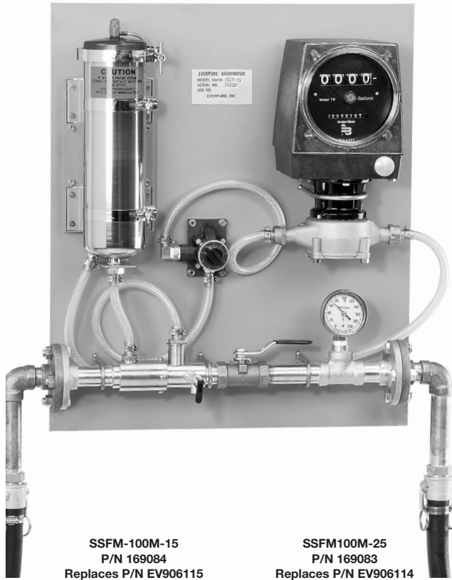
SSFM-100M-15 P/N 169084 Replaces P/N EV906115

Superior Water Disinfection in Hazardous Areas Offshore