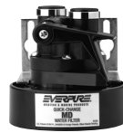
MD Single Head P/N 169110 (1 Pack) Replaces P/N EV927401 Designed for use with MD-HN & MD-HE filter cartridges.