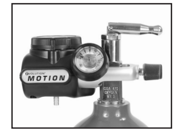
FIGURE F Attaching the EVOLUTION™ MOTION conserver to the cylinder

CAUTION! If you are unable to eliminate leaks by manually tightening the cylinder adjustment handle, replace the seal washer. If leaks persist, the unit must be returned for service.