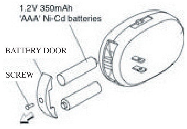
Excalibur Electronics, Inc. reserves the right to make technical changes without notice in the interest of progress.

Model No.: LL03 3700RF (MA) P&P101606 V3