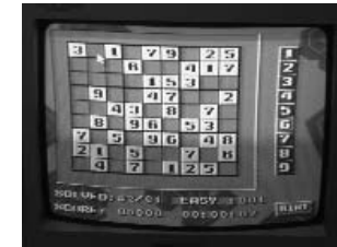
Figure 4: Puzzle

puzzle you want to play, press the START/ENTER button to confirm. The following screen will then appear.