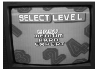
Figure 2: Select Level

After selecting PLAY NOW! , the following screen will appear on your television: