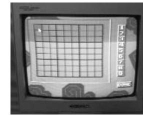
Figure 5: Blank Create a Puzzle Screen

Every time you select CREATE A PUZZLE on the opening menu screen, the following screen will appear.