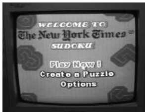
Figure 1: Opening Screen

When the game turns on, the following screen will appear on your television.