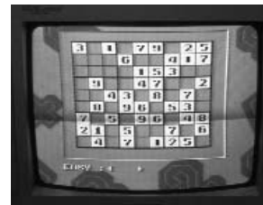
Figure 3: Puzzle Selection Screen

Use the UP and DOWN buttons to select one of the levels of difficulty and press the START/ENTER button to confirm. The following screen will appear on your television.