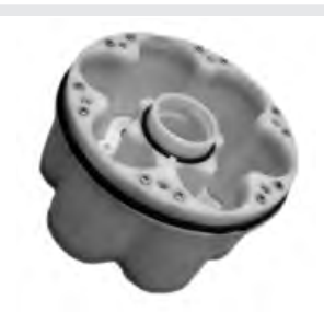
Figure 3: Battery Compartment