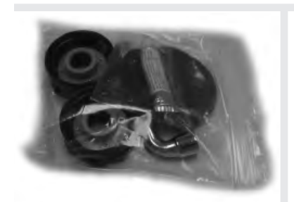
Figure 2: Nuts, Bolts, Washers O-Rings and Restoration Kit