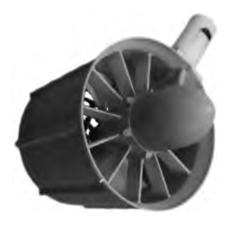
Figure 8: Motor Subassembly that Encloses the Propeller